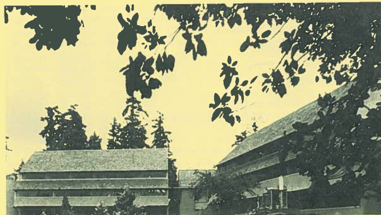
New dormitories at Shawnigan Lake School.

The Vancouver Foundation in 1971 has again employed its philosophy of offering assistance to individuals who have displayed ability and desire to attain higher levels of education, while supporting projects and con-