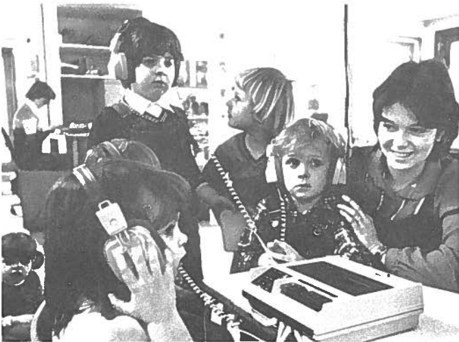
Hobbit Hill Children's Centre of the Kootenay Columbia Child Care Society at Castlegar, like other such groups in the province, provides trained staff and specialized equipment to meet needs of youngsters.