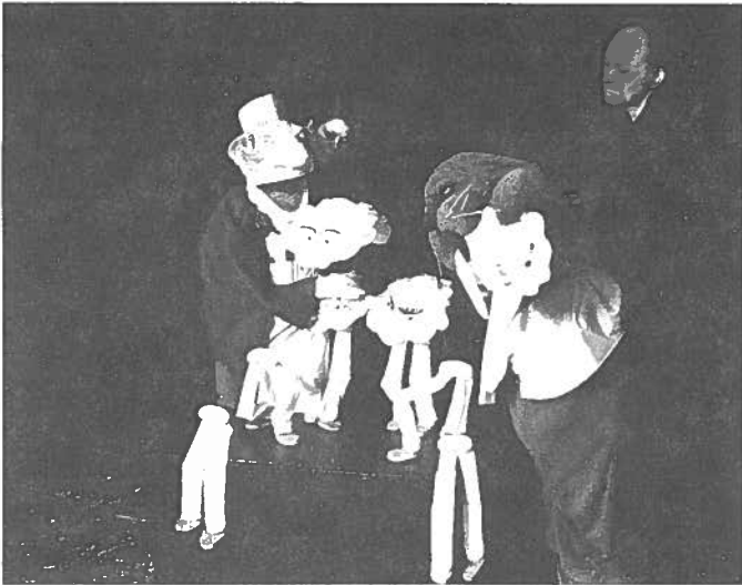
Professional actors and puppeteers of Kaleidoscope Theatre bring a variety of theatrical experiences to primary and secondary school classes throughout the province.