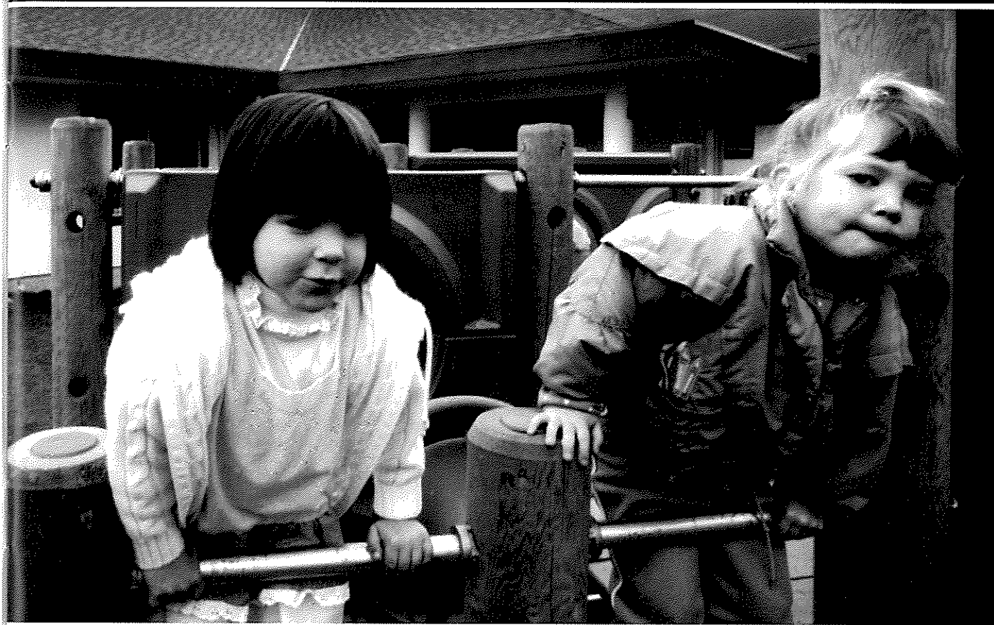
The Kaatza Daycare Centre in Lake Cowichan was totally destroyed by fire in March 1990. Until that disaster struck the Centre had provided a crucial service to 50 children. The parents rallied to raise $180,000 to rebuild their daycare centre and were helped by a grant from Vancouver Foundation.